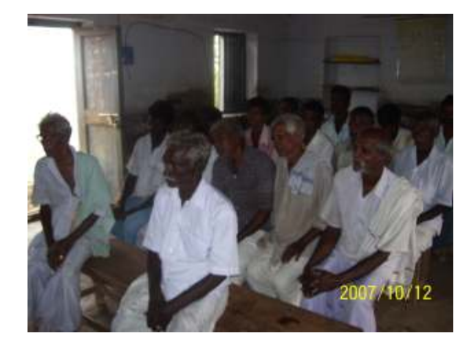
Meeting at Ulundhai / cS ei j ary; $11 k;