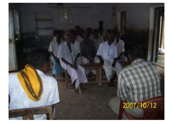
Meeting at Ulundhai / c S ei j ally; $ I ] k;

cSeij fµhk kf;fs; NflLnfhz ljpdNghy; b] l;, ejpah cSeijapy; xU $llk; eljjpaJ. cSeij fµhk kf;fs; b] l;nrayghLfs; gf;fjJ fµhkq;fspy; elggij cd;dpghf ftdp;J nfhz Lk; gf;fJ Chpy; css mtHfsJ ez gHfs; kwWk; cwtpdHfs; b] l; gz k; toq;fy; urU ngWtij fz;$lhf ghHj;Jnfhz;Lk; , UejpUf;fwhHfs; , gNghJ>b] l;nrayghlby; NrUtjwF, ej fµhkjjhHfs; $l MHtKld; , Uf;fwhHfs; mfNlhgH12>2007 mdWcSeij fµhkj;jpy; cSeij gQ;rhajJ jiytuhy; jq;fsJ fµhkggs;spapy; xU $llk;eljjggl!J. b] lbd; midjJ nray;fisAk; mwp;J mej fµhkjjhHfs; kfpoNthL, UejhHfs; tpiutpy; b] l;rWFOtpy;NrucWjpmsjjdH.