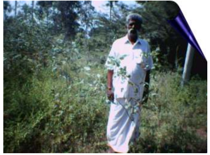
Mullaippoo Small Group of Placepalayam gNs];ghi sajijr;rhHej Kyi ygG+rfWFO

Chezhumai - TIST India monthly newsletter