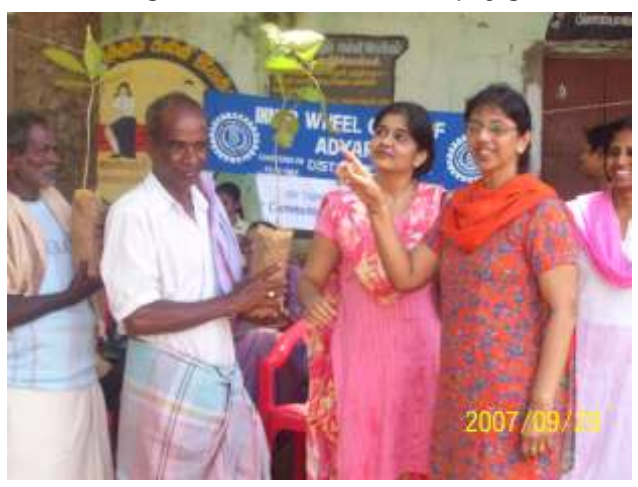
Inner Wheel Club membes are distributing free seedlings to TIST members , d;dH tly;fpsg;cWggpdHfs;b] ;l;cWggpdHfS f;F , ytr kuf;fd;Wfs;toq;Fj y;