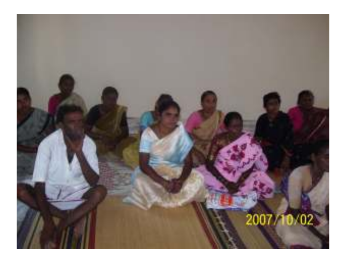
Meeting at Katchur / fr# hy; $11 k;

b] 1; mfNl hgH 5k; Nj j p 2007 y; j d J $11 j i j fr# hpy; $1 baJ>fr# H>Cj; J fNfhl i 1 apypUe;J 6 fpkl nj hi ytpy; j pUts;@ H nry;Yk; topapy; css xU rpWfpuhkk; mej $11 j j py; 10 rpW FOf;fspypUe;J 22f;Fk; mj pfkhd ngz; cWggpdHfs; gqNfwwdH. mtHfs; fpAl NI h> GNuhl 1 hfhy>fhHgd; tpahghuk; kw,Wk;b] 1;, ej pa nrayghLfs; gwwp ed;F nj hpe;J nfhz 1 hHfs; fr# HgFj pcWggpdHfs;j q;fs; epyq;fspy; kpfTk; fbdNti y nra;J nfhz bUf;fpwhHfs; Vnd dpy; mtHfs; epyk; fbdkhd ghwhq;fy; kw,Wk; $ ohq;fw;fi s ci l aj ha;, Uf;fpwJ.