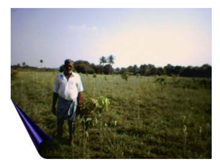
Mullaippoo Small Group of Placepalayam gNs];ghi sajijr;rhHej Kyi ygG+rpWFO

, ej rWFO b] l; cld; MWkhjqfSf;F Nkyhf , Ue;J tUfpwJ. mtH jq;fsJ kuq;fis gNs]; ghi sak; fpuhkjjpy; el;Ls;shHfs; mtHfsJ fZ i kak; gNs]; ghi sakhFk; mfNl hgH 15> 2007y; fz fnfLggpd; NghJ>, e; rpWFOthd 4 el ej nttNtW , dkuq;fshd> Njf;F> kh> nfha;ah> A+fhtg;]; vd vyyhk; nkhjjkhf 1178 kuq;fs; ngw,wpUejJ., jd;cWggpdHfs;kh>A+fypgl];kw,Wk; NtW rpy , ej pa , d kuqfs; vyyhk; nkhj j khf 1730 MFk; 4 nttNtW , dkuq;fis nfhz; хU ehwwhq;fhiy $1 itj;JsshHfs; , ej røWFO cWggpdHfs; gpNs]; ghi sajjpy; elf;Fk; mi dj;J $1;1qfspYk;fye;Jnfhs;fpd;whHfs; mjdhy;gpNs]; ghi saj j y; css mi dj J cWggpdHfi sAk; mej $11jjpy;fye;JnfhssnraacWjpaha;cssdH.