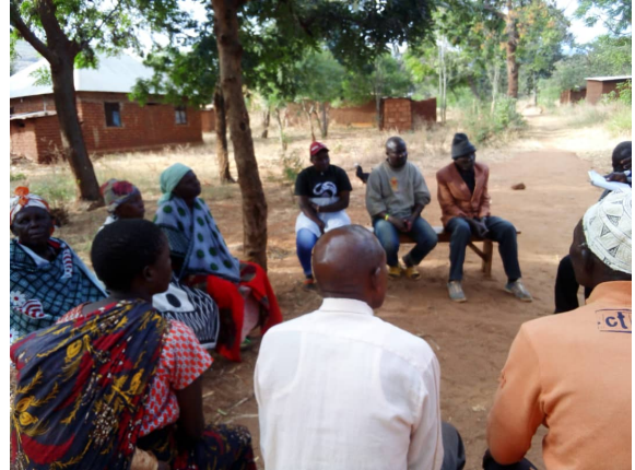
Picha 2: Mfano wa namna nzuri ya ukaaji unaopendekezwa kwenye mkutano wa kikundi

Kiongozi wa mkutano anaeleza kilichopangwa kwa ajili ya mkutano na wanakikundi wanajadili na kisha kukubaliana kwa pamoja juu ya ajenda za mkutano. Muda unaotumika kwa kila mjadala unapaswa kukubaliwa ili mtu anayewajibika asaidie kuweka mkutano uende kwa wakati.