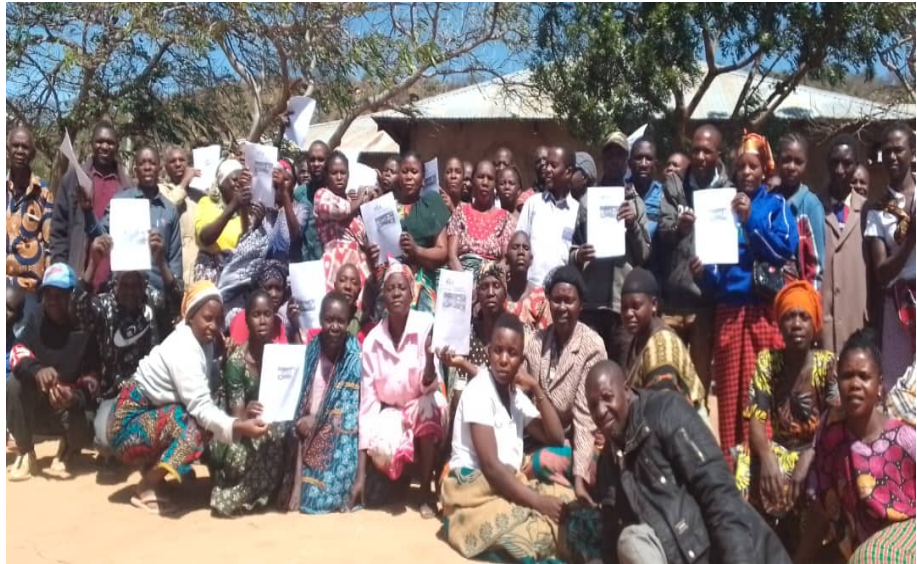
Picha 1: Mkutano wa Klasta ya Ibwaga Kongwa, uliofanyika mwezi Juni 2024

Hii ni muhimu katika kuwahakikishia wanunuzi wetu (wanunuzi wa kaboni) kwamba kile tunachowaambia kuhusu shughuli za Kikundi Kidogo ni kweli na sahihi. Pia itawapa wanunuzi imani na kutuamini katika Mpango wetu, hivyo basi wanaweza kununua kaboni kutoka kwa wakulima wa TIST. Kwa hiyo; tunawataarifu Vikundi vyote Vidogo tuwe tayari na kujiandaa kuwapokea wageni na kuwapa ushirikiano wakati wa zoezi la uthibitishaji na uidhinishaji.