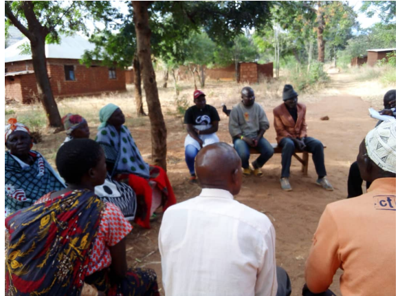
Photo 2: An example of a good sitting manner suggested in a group meeting