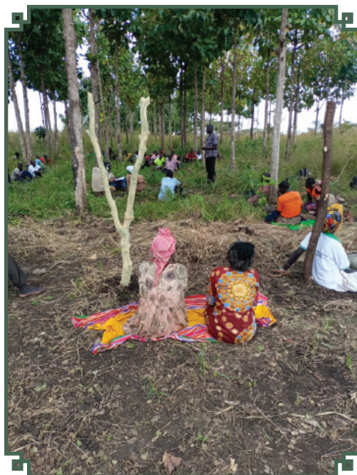
Small group meeting and training in Soroti

The TREE is a monthly newsletter Published by area of The International Small Group and Tree Planting