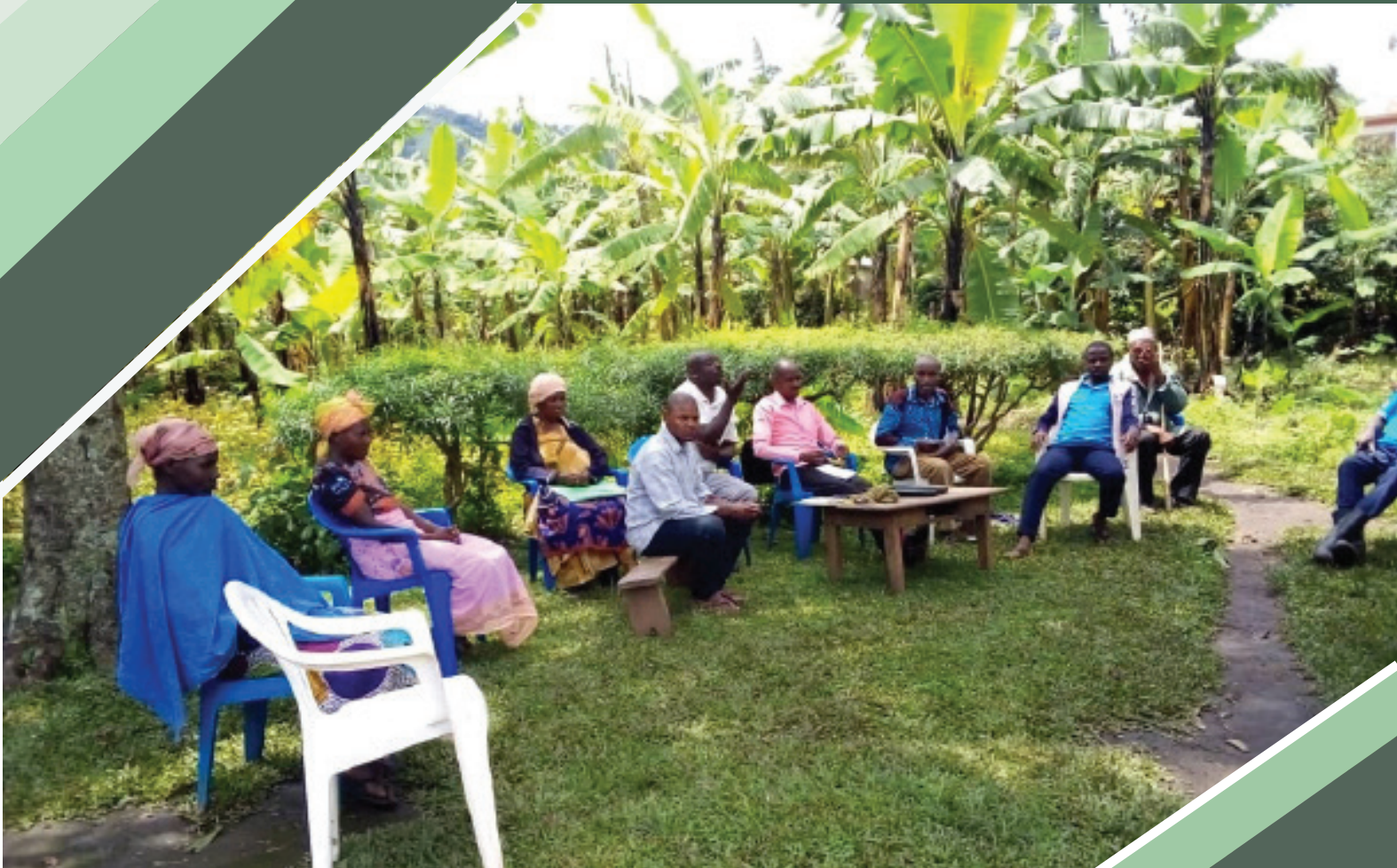
Small group meeting and training in Bushenyi-Kyaruganda Cluster