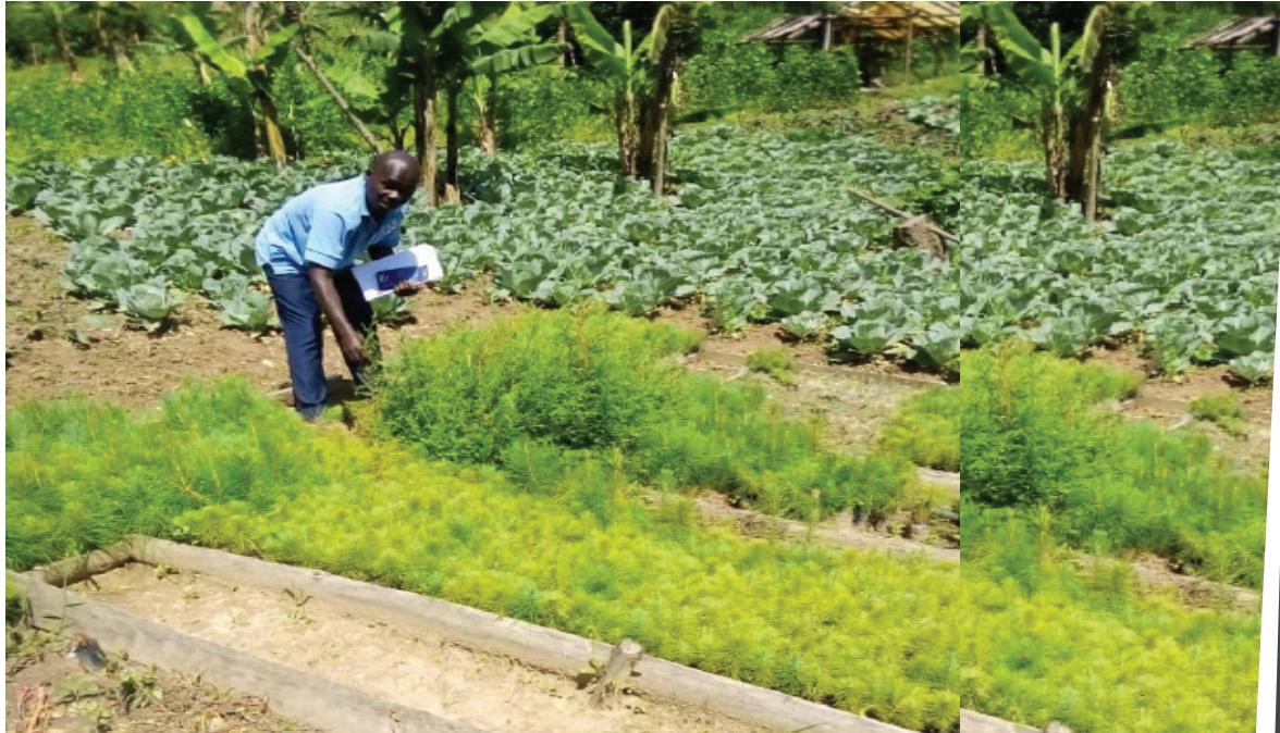
Weeding and removing weeds in a nursery bed