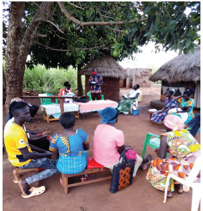
Small group meeting held in Karungu Kiryandogo

FOR TIST general inquires about TIST expansion, Payments, Trainings, small group formation and registration, and Tree Planting call: 0785 - 322715 (TIST Answer Desk)