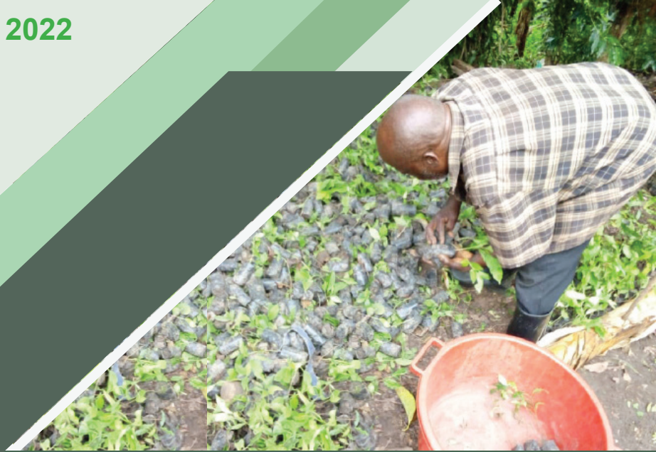
A farmers taking pronus seedling to plant.